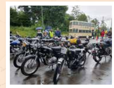
Classic Motorcycle Day 2023