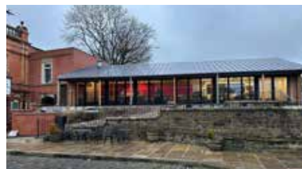
Tram Stop Café

See website for menus in the Tram Stop Café. Every penny you spend with us goes into supporting our work preserving these unique vehicles for future generations.