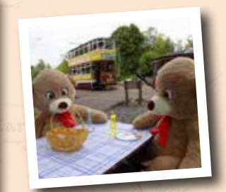
Teddy Bears Picnic